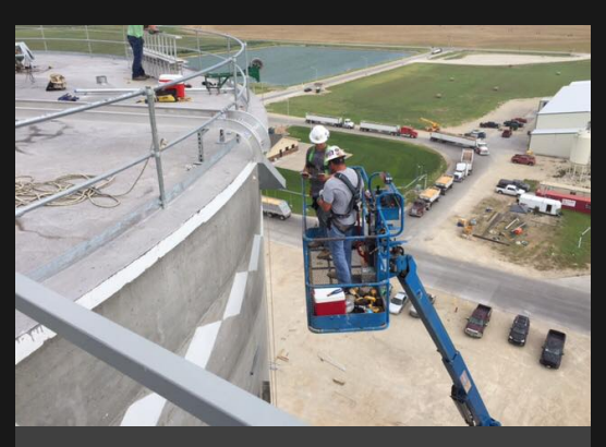
Using the lift to complete some work on grain storage upgrades in Lyons, KS.

Our mailing address is: 4500 West Harry Wichita, KS 67209 316-265-8182 www.decker-electric.com