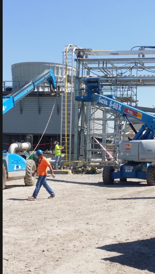
Decker contractors pulling in one of the main feeder cables (15 KV) for the plant. Foreman, Jesse Robinson.