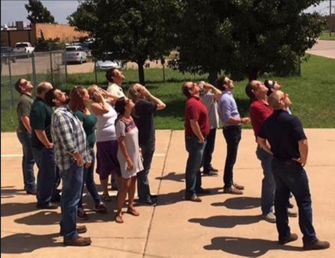
Decker employees take time to check out the solar eclipse.

Our mailing address is: 4500 West Harry Wichita, KS 67209 316-265-8182 www.decker-electric.com